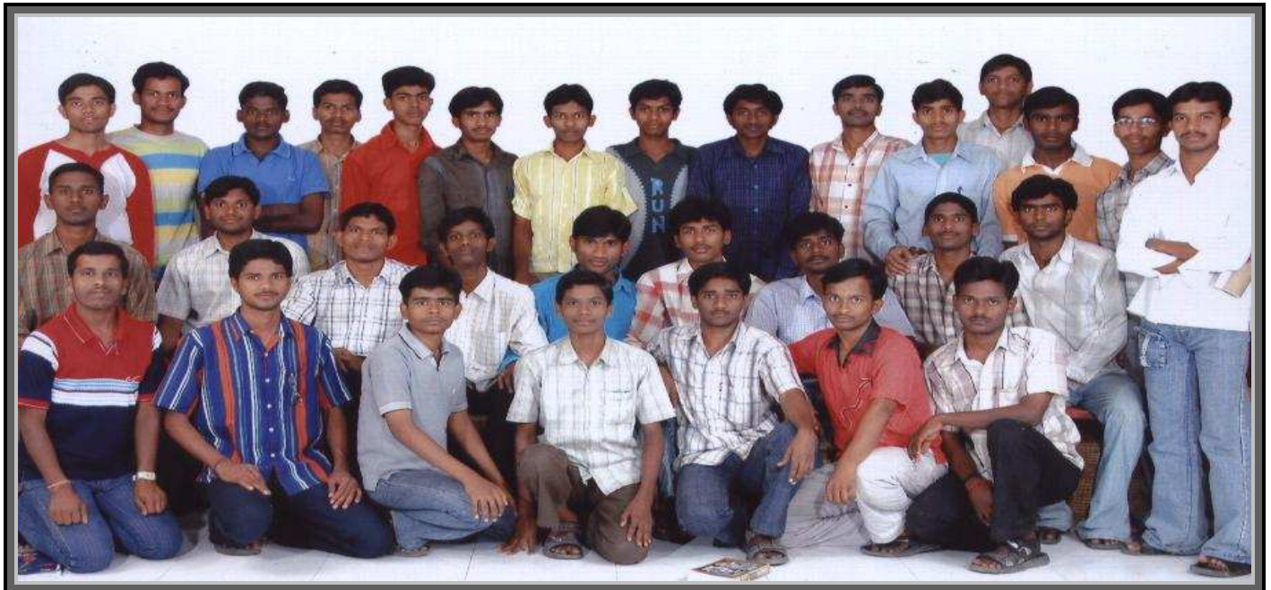
SKY IS THE LIMIT FOR US AT AVG WITH YOUR SUPPORT