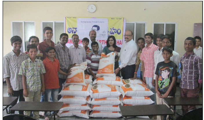
Eight Quintals of Rice is donating by Nagarjuna Foundation on the eve of Founder's Birthday Celebrations on 29 th June 2014